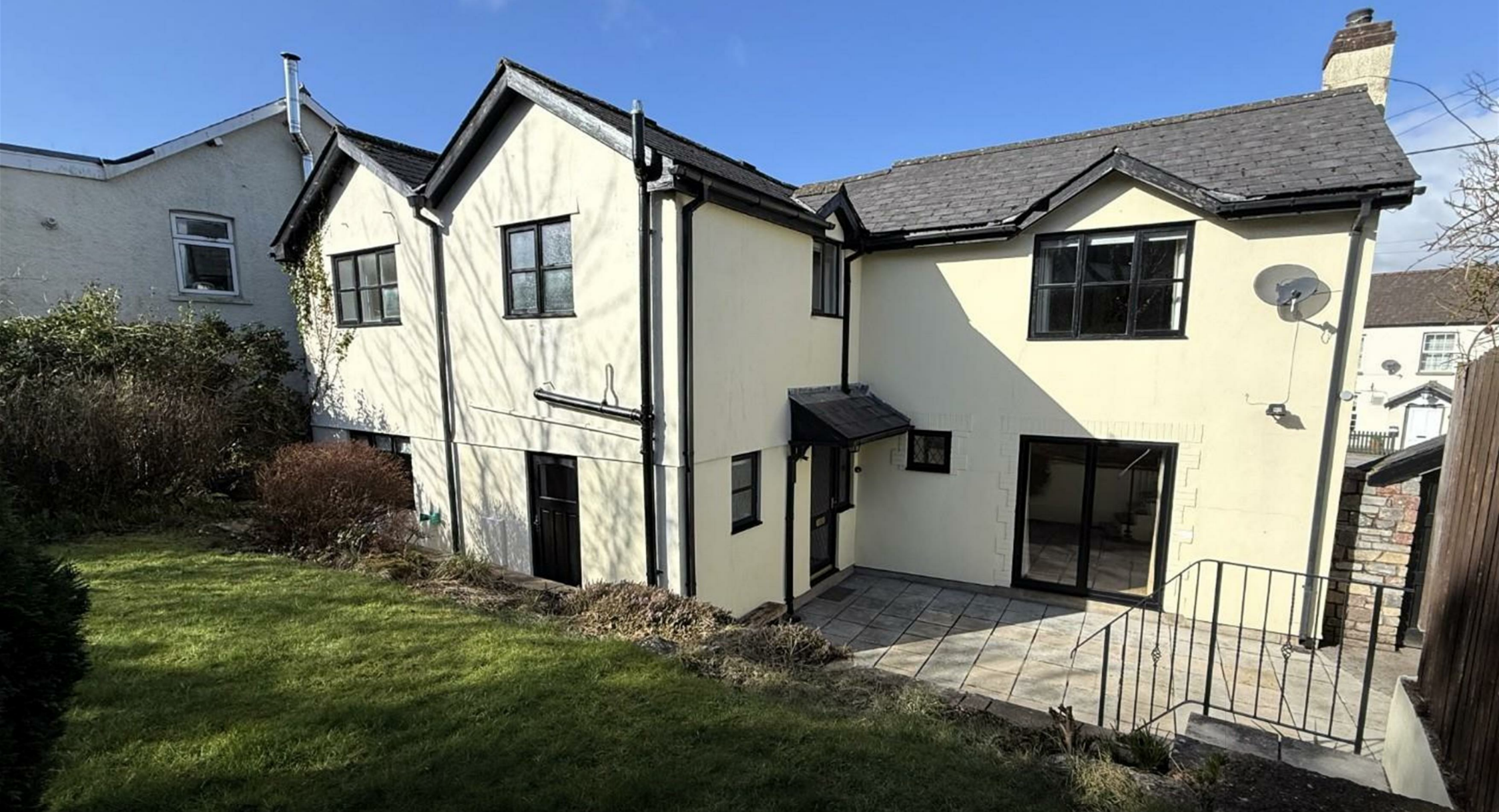
The Coach House, Aberthin Road Cowbridge, CF71 7LE